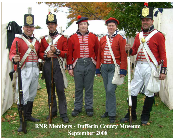
RNR Members - Dufferin County Museum September 2008